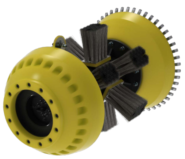
Tool design may vary from images shown.